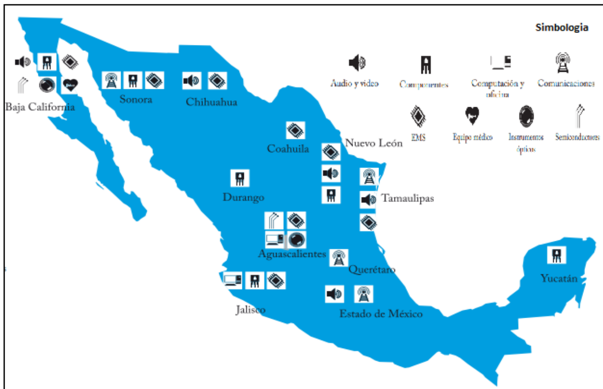
Figure 1. Areas in the electronics industry in Jalisco.

The map shown in figure 1 below shows the specialization of each state, i.e., the type of industry that is set there. Jalisco is composed of SMEs companies, computer components and office. Notably, these firms are in the area of technological innovation. Based on the written information labor it will be affected by these technological changes. This will lead to problems in the education system because the programs do not settle for dynamism in the labor market which if does not make the appropriate changes, it will be left behind.